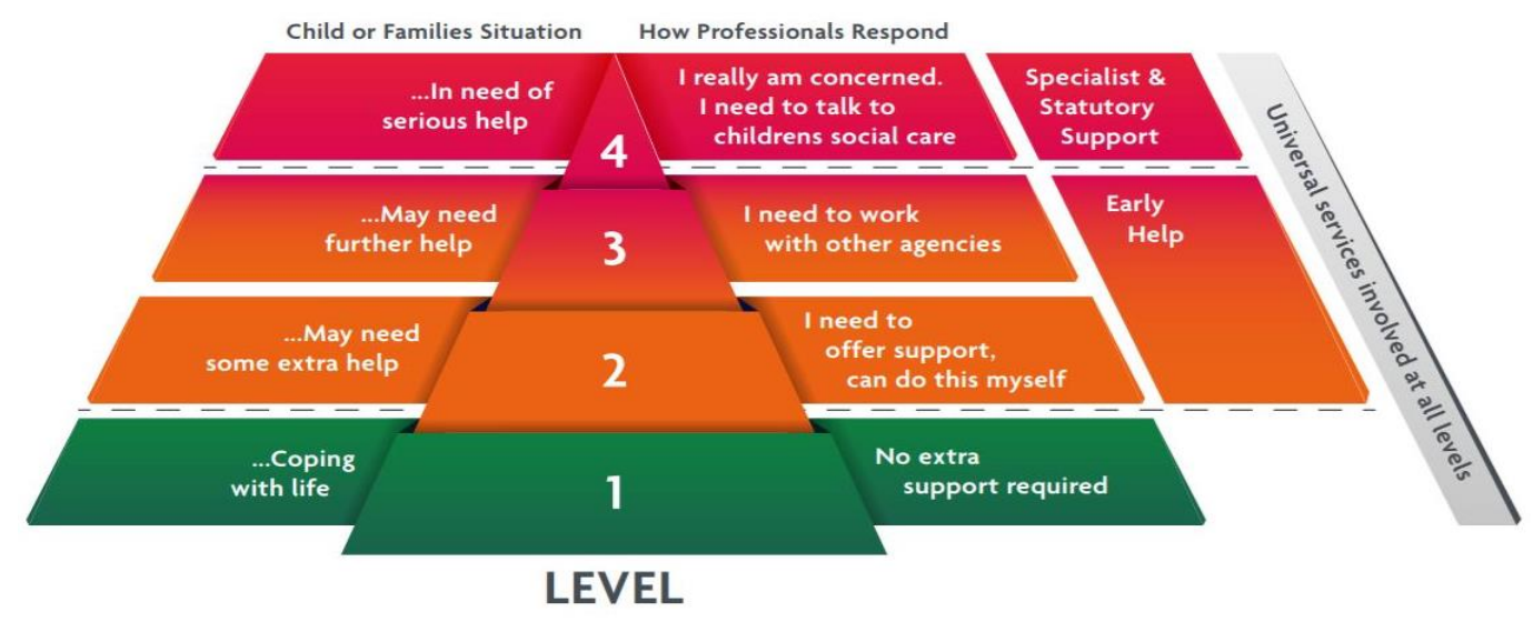
Figure 1: Levels of Need

However, a child's needs can change and s/he can move forwards or backwards, which reinforces the importance of effective, seamless processes to ensure continuity of care when a child or young person requires different levels of support and moves between services. Also, it is important to note that information, advice and guidance should be available to children and families at all levels of need.